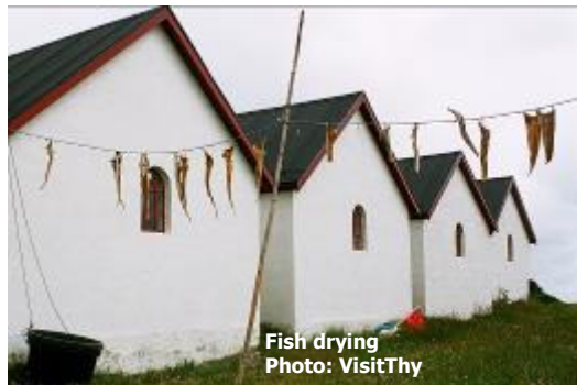
Fish drying

This road can be difficult to find as it has no name. Cycle along the paved road. When two gravel roads cross the paved road and the gravel road to the west shows a shelter sign, turn east.